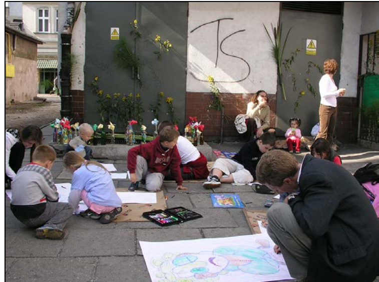
Photo 3. Children's work in the project entitled Temporary gardens in Kraków.