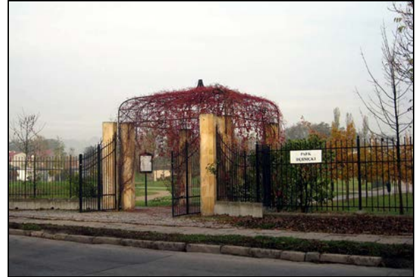
Photo 5. The New Dębnicki Park in Kraków, established as a civic initiative.

Source: designed by K. Pawłowska, K. Dąbrowska-Budziło, A. Zachariasz, K. Fabijanowska