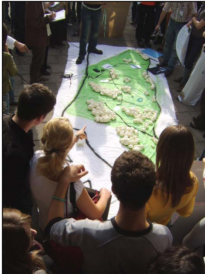
Photo 2. Design workshops for the Zakrzówek Park in Kraków.

For a number of years, students of architecture and landscape architecture have been told the principles and methods of social participation in design, with the most extensive programme being conducted for students of Landscape Architecture at the Faculty of Architecture of Kraków University of Technology (PK) 8 (photo 2, 3). Worth emphasising is the fact that it is one of the ways of implementing the postulates of the European Landscape Convention in matters concerning education. 9