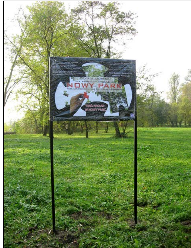
Photo 1. Poster – invitation for residents to a discussion concerning the management of public space in Kraków.

Obviously, it is best for the final solution to be the corroboration of full approval and acceptance, yet despite any efforts, such final result cannot always