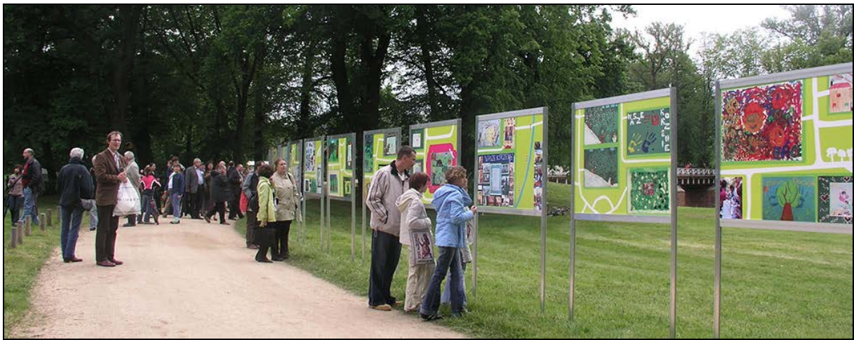
Photo 4. Exhibition of works by children and young people developed in the project entitled my space , and concerning the Mużaków – Bad Muskau Park on the Polish German border.

of participation frequently hear from the West European consultants and advisers that these processes are difficult not only in Poland, and that it is not only in Poland that failures do occur. Nevertheless, it is the fact that the direction of flow of standards and patterns of participation leads generally from the West eastwards (photo 5). Some American research methods – e.g. the workshops developed by the National Charrette Institute in Portland 19 and the methods of animation of public spaces (“placemaking”) used by the Project for Public Spaces 20 – are treated as certain touchstone solutions and disseminated all over the world. Another, quantitative proof for the disproportion is the percentage of Poles involved in the operation of non-governmental organisations, which is a number of times smaller than the analogous ratio in countries that have long enjoyed democracy. 21