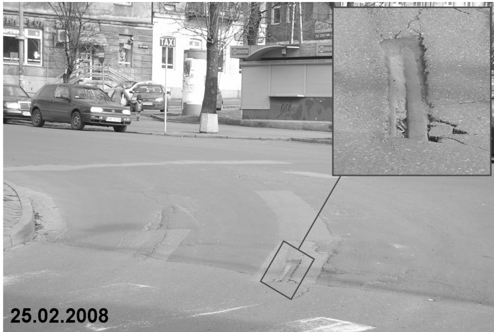
Photo 1. Małachowski street and Moniuszki street crossing with a disclosed track section.

Cataloguing is carried out in areas where a tram route was running. Taken into consideration should be not only routes determined during study researches, but also a directly surrounding area, where elements of infrastructure or its remains can be found as well 1 .