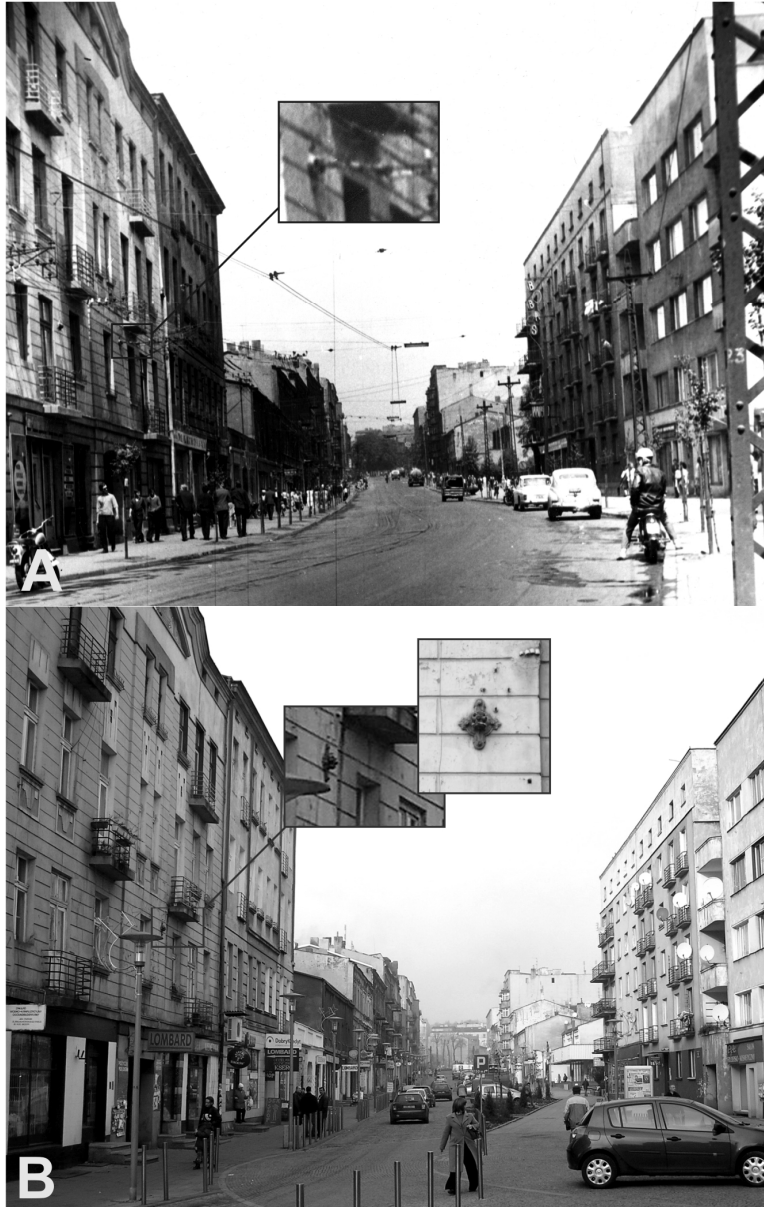
Photo. 3. View of Małachowski street northward: A-archival photo with the noticeable overhead (from Zagłębie Museum in Będzin archives), B-current photo with remained tram bracket on the building wall Source: by M. Rechlłowicz.